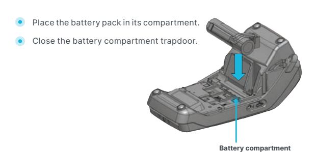
4.5.3 Charging the battery